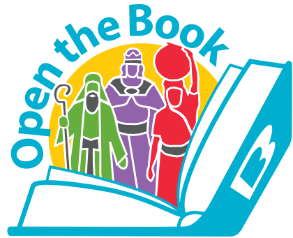
Bringing the Bible to life for every child in every primary school