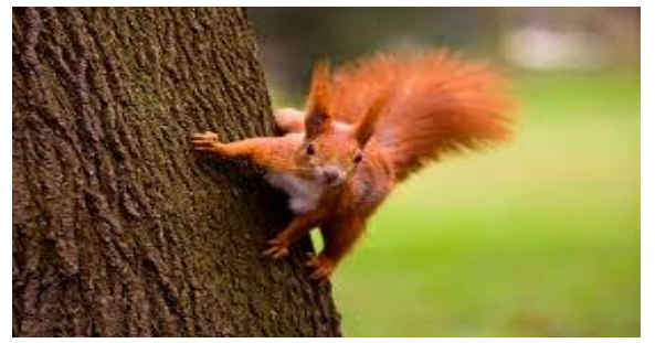
Here are a two photos to investigate.

They can be seen in the Channel Islands, on Brownsea Island in Poole harbour and in the north of the UK. Red Squirrels are a glorious orange red colour and are just as cheeky as their Grey cousins.