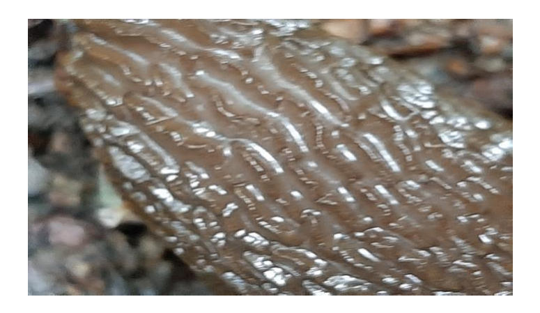
Cryptic Quiz I am grey. I bully my smaller red cousin.

I'm not from this country. I was brought here by the Romans because they liked to eat me! (The Romans ate lots of strange things!)