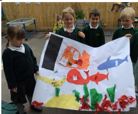
Catkins 'No More Single Use Plastics' Poster

On Wednesday we found out more about the damage that single-use plastic is causing, and what we can do to help. Following on from our whole school assembly on Wednesday, we would like to challenge as many children as possible from Firle CEP School, to write a letter to Chartwells Catering Company, asking them to stop putting single-use plastics in our school packed lunches. This would mean that they would no longer provide disposable water bottles in packed lunches and we would need to have our own re-usable water bottles: a small step in the right direction.